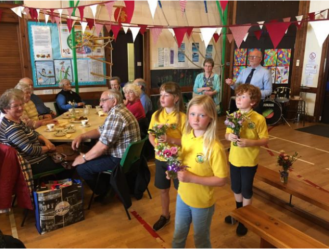
Clash for Clan