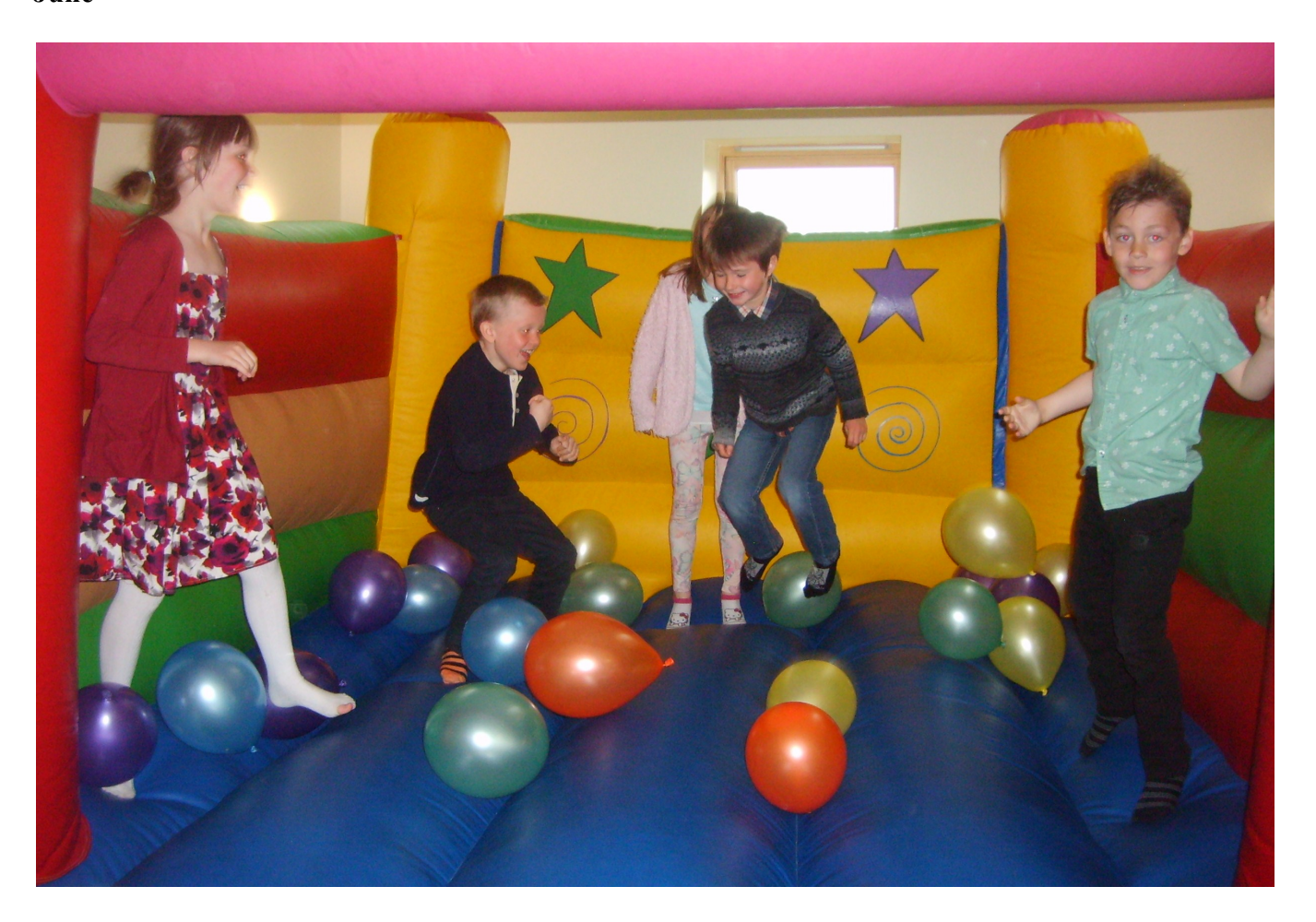
Spot the Difference

Below is a photo taken following the Sunday School Prizegiving which was held on Sunday 21st June