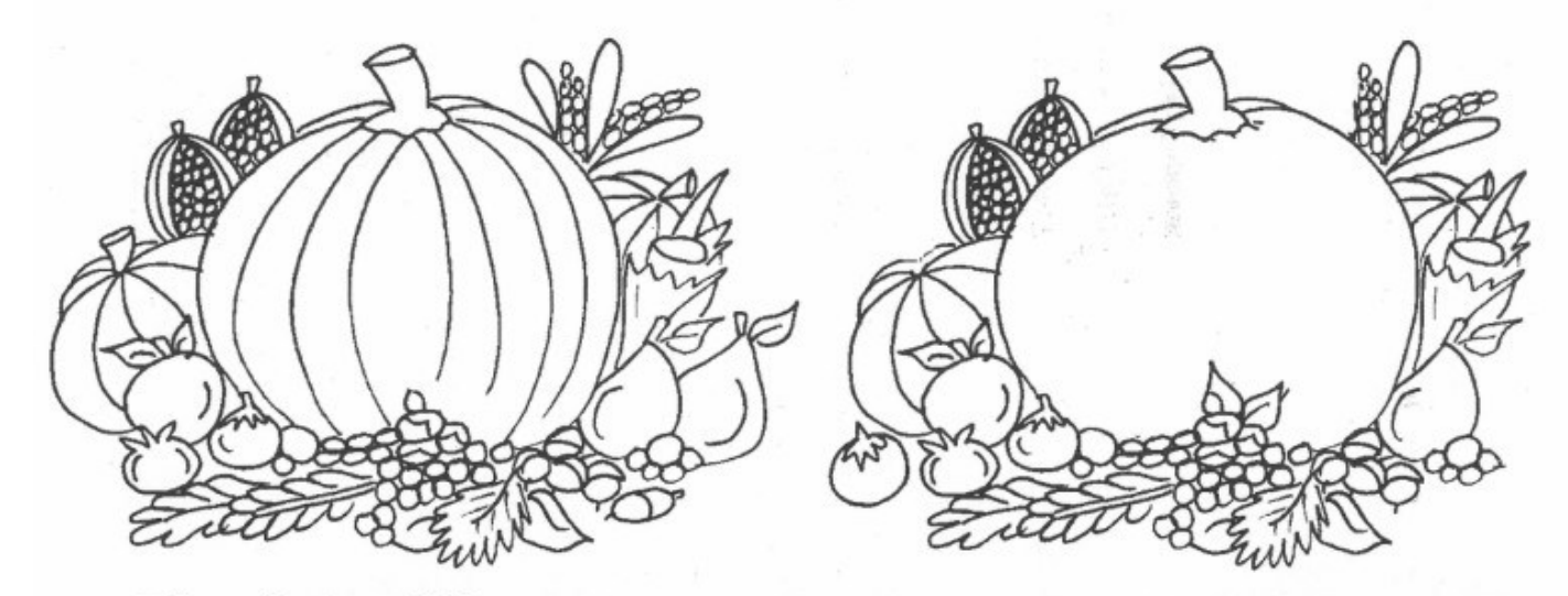
Find 6 differences between the pictures