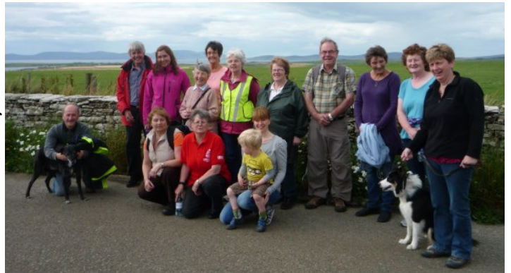
On arriving back at kirk at the end of the walk we were amply refreshed with tea and biscuits to for-

this year, for the greater part of the walk the group seemed to mingle with each other’s groups, swapping conversation partners more than once. By this, it proved to be an excellent opportunity to get to know a variety of people whom we may see only briefly in church without the time constraint which perhaps is the case when we meet after Sunday services.